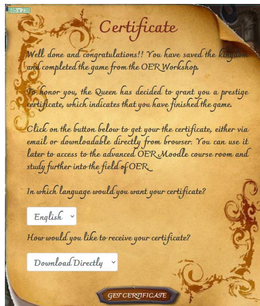
Figure 2. The certificate is ready after completing the game

After the players finished playing the game, the certificate button will be activated to provide the participants with an automatically generated certificate, which indicates that they have acquired the basic knowledge regarding OER (Figure 2. ). With this certificate, they will get access to advanced courses or workshops about OER, which are part of their teacher-training program. Furthermore, participants' suggestions and feedback are collected with a survey prompt at the end of the game and sent anonymously to workshops' organizers to be analyzed. This feedback will serve as a valuable information source to improve the game in the future iterations and for further development. The game can be found under the following URL: https://oer-cycle.elearn.rwth-aachen.de .